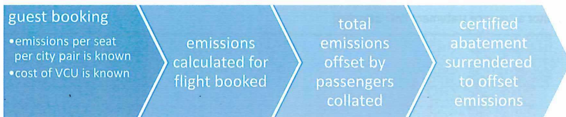
Figure 1 Illustration of the general Fly Carbon Neutral Program steps.

Figure 1, below illustrates the general Fly Carbon Neutral Program operated by Virgin Australia. Noting that prior to the point of a passenger making a flight the emissions per seat for each city pair are known (based on the previous year), and the cost per tonne CO 2 -e is known as carbon units are purchased in advance.