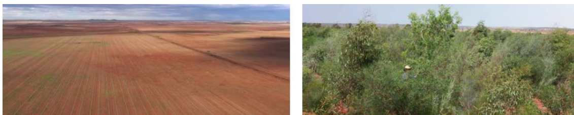
Yarra Yarra corridor before and after reforestation

TEDxKingsPark is proud to support a local offset project, located in Western Australia's northern agricultural region approximately 400 km north of Perth. The wider area is one of only 34 global biodiversity hotspots. The project removes 1.897 million tonnes of carbon in a region where over 90% of the woodland has been cleared.