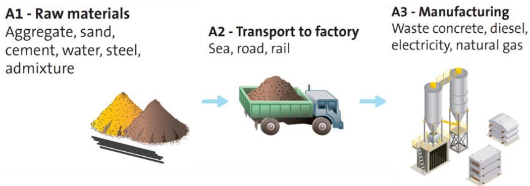
Figure 1 – Cradle-to-gate (A1-A3) life cycle stages of precast concrete products

The responsible entity for this service certification is Holcim Australia Pty Ltd, ABN 87 099 732 297.